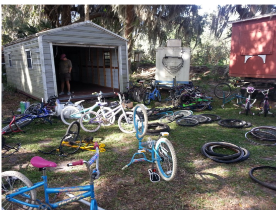
L: Work in progress