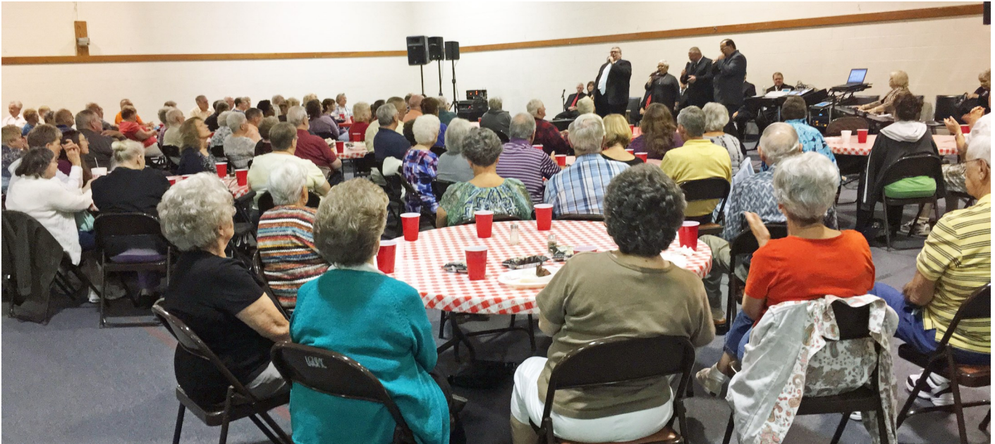
Popcorn concert and lasagna dinner.