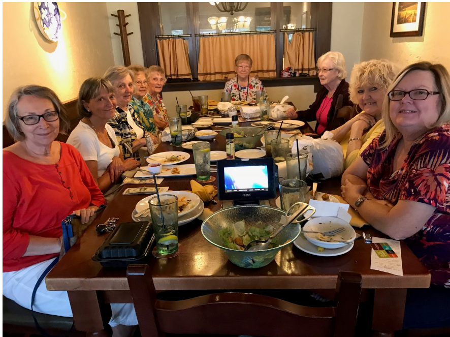
Ruth Circle of Love's June luncheon meeting at Olive Garden in Lakeland.

The next meeting of the UMW Leadership Team is scheduled for Monday, July 30th, at 1:00 pm in the FLC.