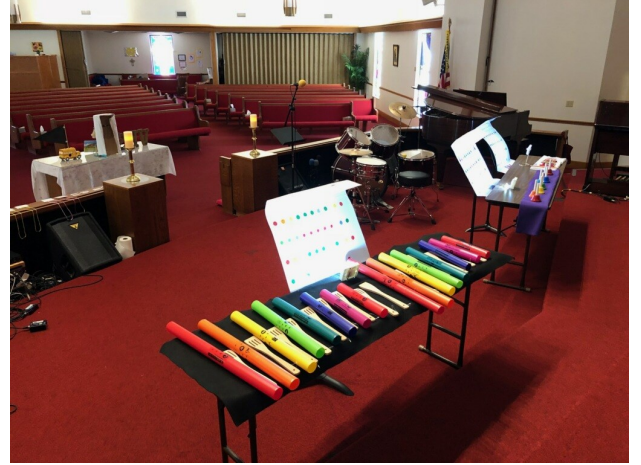
Above: Boomwhackers ready!