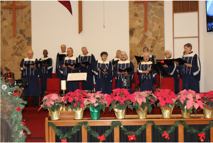
The Choir (left)