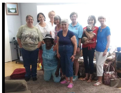
Aug 21, 2019 OTG.