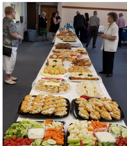
Ready to comfort family and friends after a memorial service.