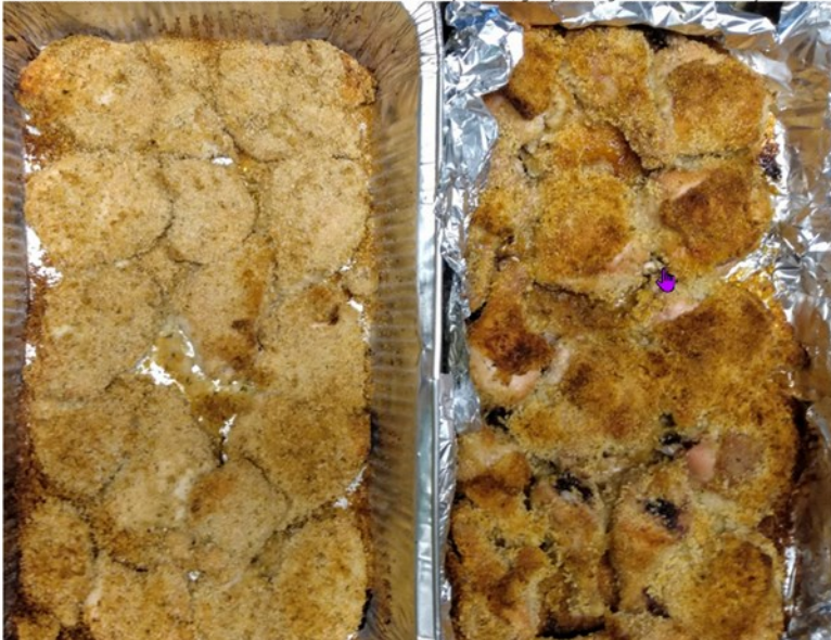
White meat or dark? Lunch: breaded chicken, homemade mashed potatoes, gravy, stuffing and broccoli Melody.