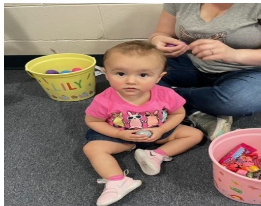
All photos approved by parents